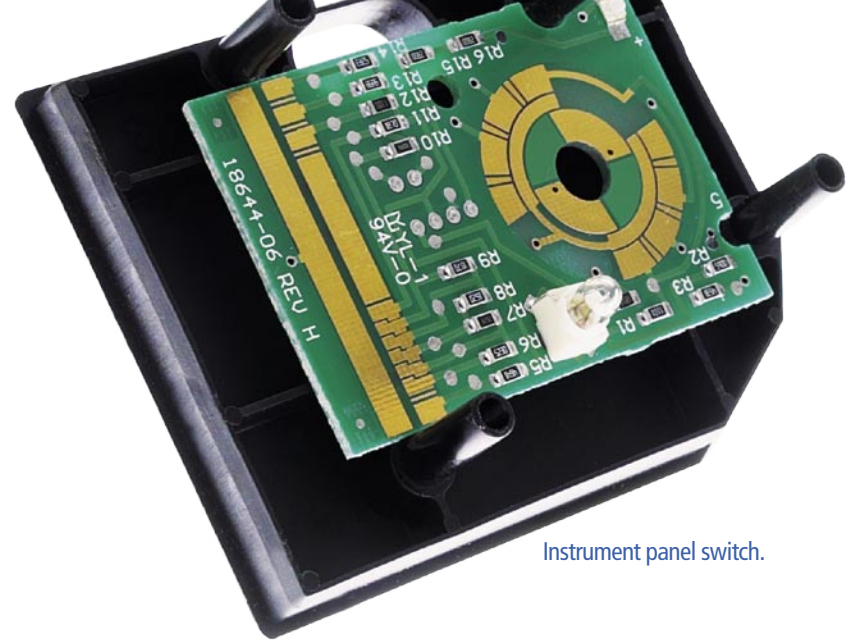
Instrument panel switch.

t 905 681 7544 f 905 681 7601 info@etrtech.com www.etrtech.com