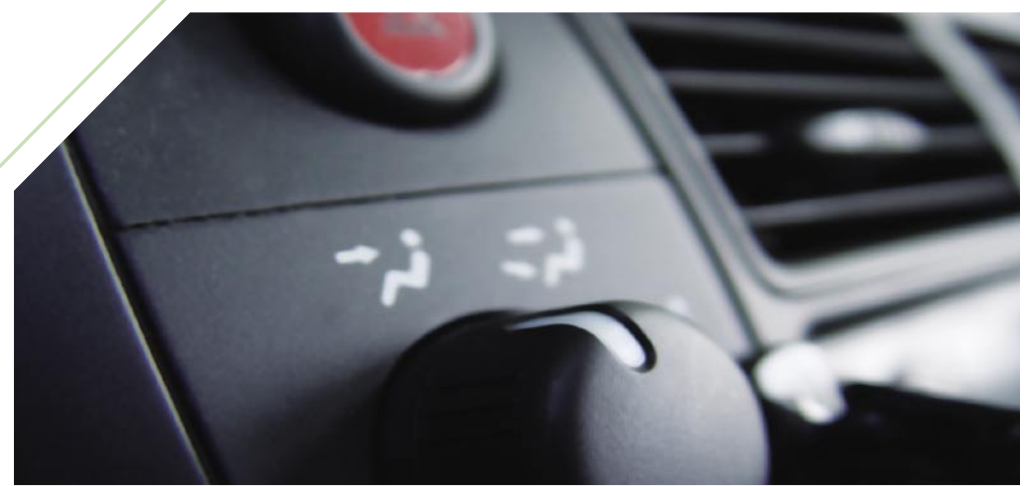
We understand the requirements of automakers and automotive parts suppliers, and provide a complete end-to-end product development and manufacturing solution.

Etratech's unique Total Acquisition Management™ (T.A.M.) process means competitive pricing is maintained through direct factory OEM negotiating and volume leveraging. We use a supplier rating system to ensure the highest material standards and to reduce lead times.