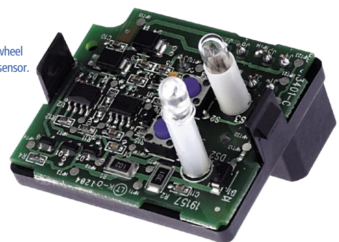
Two-wheel / four-wheel drive train system sensor.